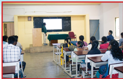
Smart Class Rooms - 02