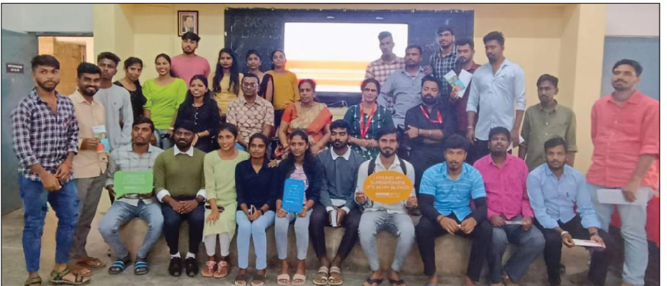
Blood Cancer and Stem Donor Drive - January 2023