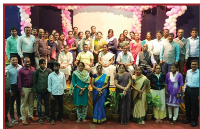
NEP (2020) Workshop for Teachers