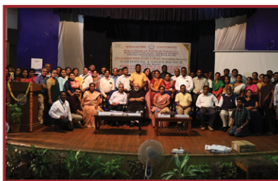
National Seminar - Indian Politics at 75