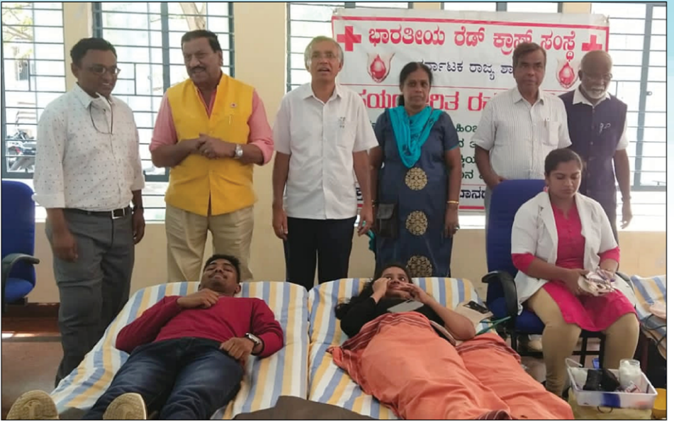
Blood Donation Camp - March 2022