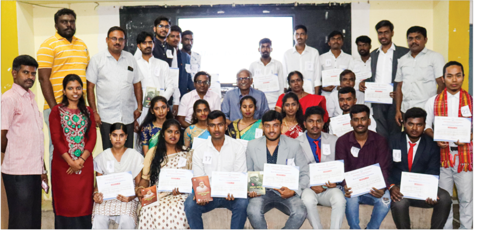
Mock Parliament - October 2022