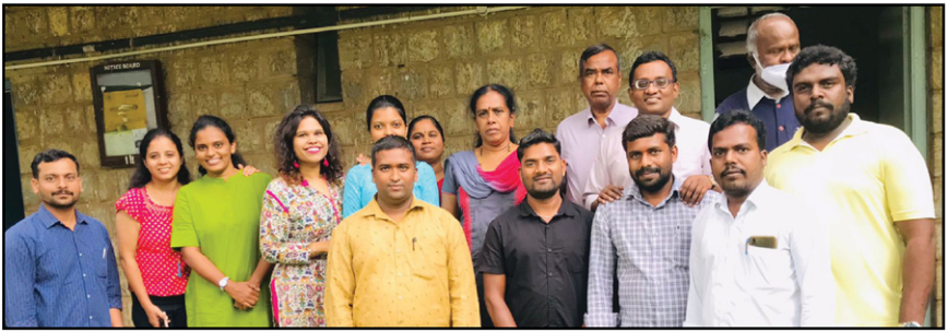
Ph.D. Scholars 2020 - 2021 Batch

The department consists of 106 PG students, 27 Ph.D Scholars, and foreign students - PG (01) and Ph.D (02). So far 33 Doctoral degrees are awarded (2017- 2022).