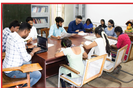
Dr. B.R. Ambedkar Library No. of Books - 1412